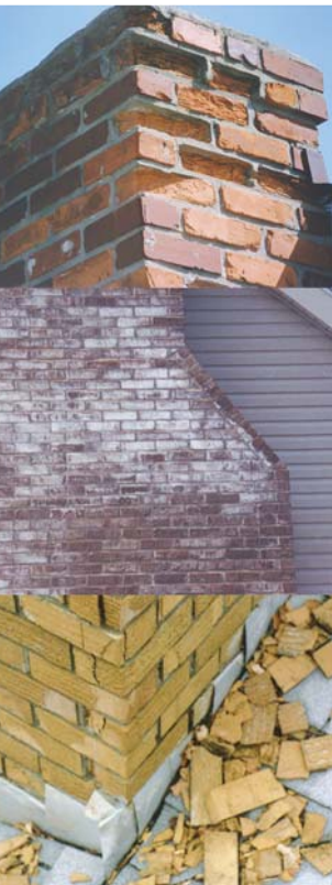
Severe spalling and deterioration is caused by water penetration.

Chimneys are highly exposed to the elements and, if left unprotected, are susceptible to structural deterioration. It is important to address this problem before serious damage occurs. A complete chimney protection program should include repairing the crown with CrownSeal or CrownCoat , as well as waterproofing the entire chimney with ChimneySaver water repellent.